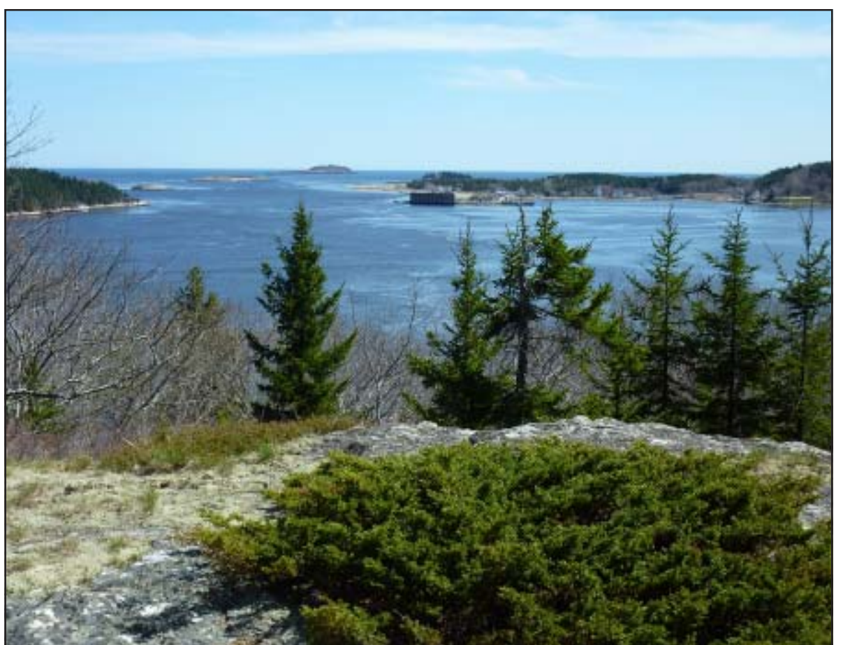
Left: Bog bridge construction, Sprague Pond. Above: The view from the new Wilbur Preserve at Cox's Head.