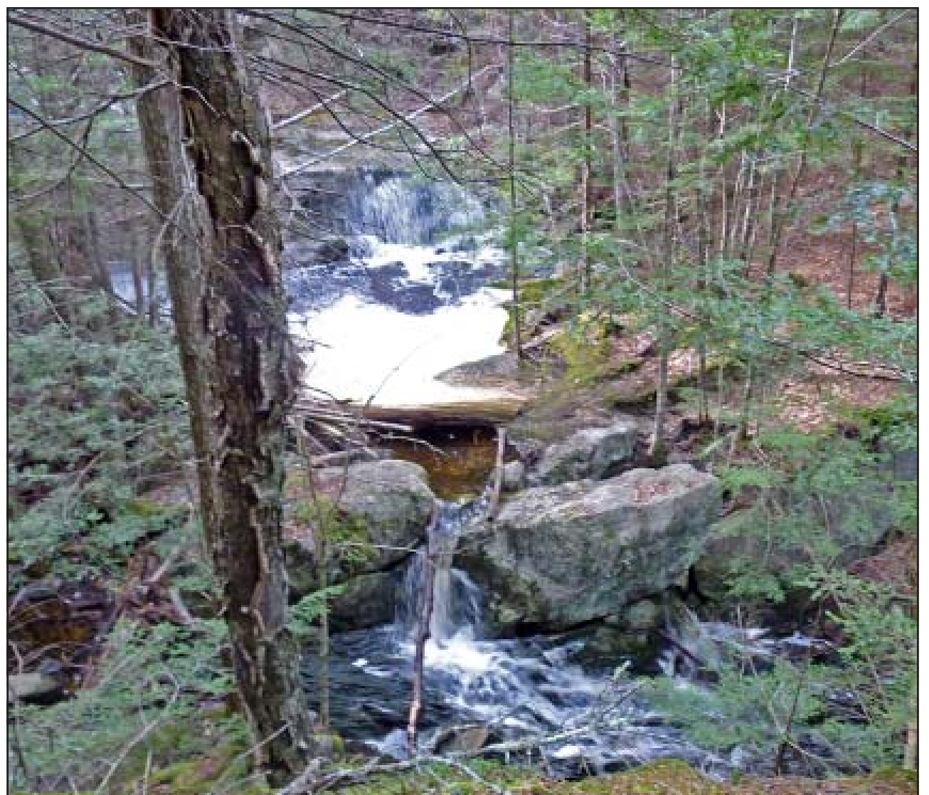
Falls at the Sprague Pond Preserve.